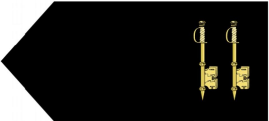
Assistant Comptroller of Customs