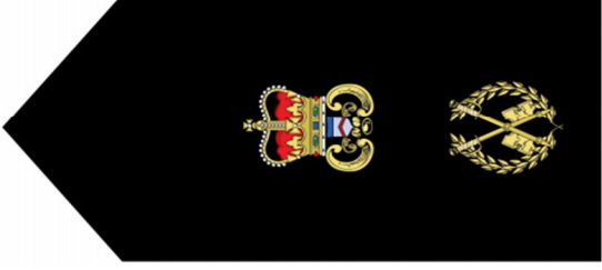
Deputy Comptroller of Customs