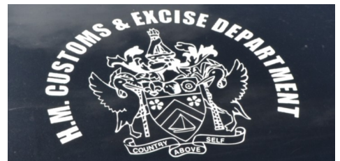
Customs logo, currently under revision.

The Office of the Comptroller is prepared to launch the new logo in the final quarter of 2012, where all Customs materials, including vehicles, letterheads and marquis will be rebranded.